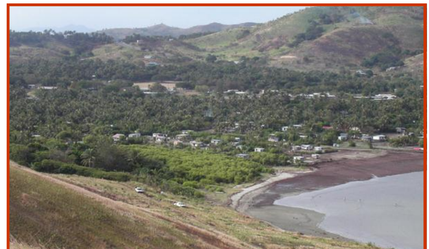
Joyce Bay, KilaKila: Sewerage Treatment Plant Site