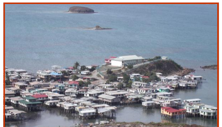
Hanuabada Village: Pilot Project Site