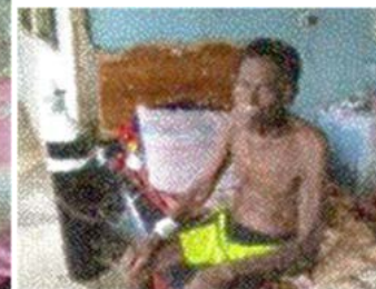
A patients with respiratory problem