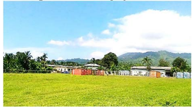
Beautiful sky in PNG