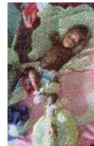
A child with fracture

Vital information regarding current situation of Physical therapy service in PNG is scarce. This information or statistics are vital to understand current situation and to develop the Physical therapy service in PNG.