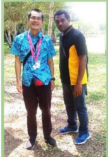
My counterpart (colleague)