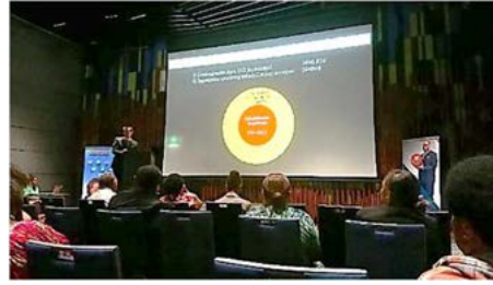
Presentation in the PNG Medical Symposium, 2019

This result imply that professional education and international cooperation of physical therapy for patients with these conditions are needed. During the period of my volunteer activity, I was honored to make a presentation about this research in the PNG Medical Symposium. Moreover, our research was published in the PNG medical journal.