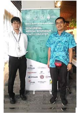
PNG Medical Symposium, 2019