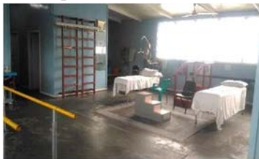
Physical therapy room Kimbe Provincial Hospital

I was assigned to the Physical Therapy department of the Hospital in which I treated both in- and out-patients working alongside local counterparts. In addition, I also conducted clinical research with my counterparts.