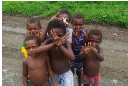
Kids in a rural village