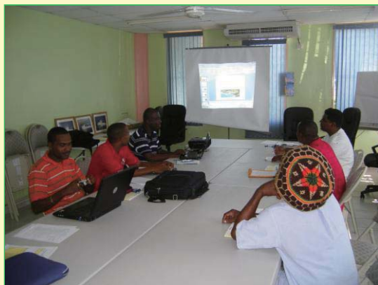
Presentation of country report by the participants

In order to evaluate the outputs of the training course and follow up ex-trainees activities, three (3) day workshop was held in St. Lucia from March 2 nd to 4 th 2011.