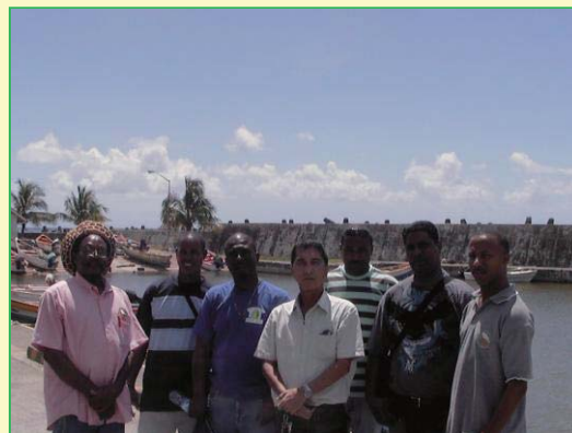
All participants and JICA expert in Choiseul

The workshop was comprised of two components; (1) in-door session such as presentation of country report, discussions and (2) outdoor activities like site lectures at machine side in various fisheries complex.