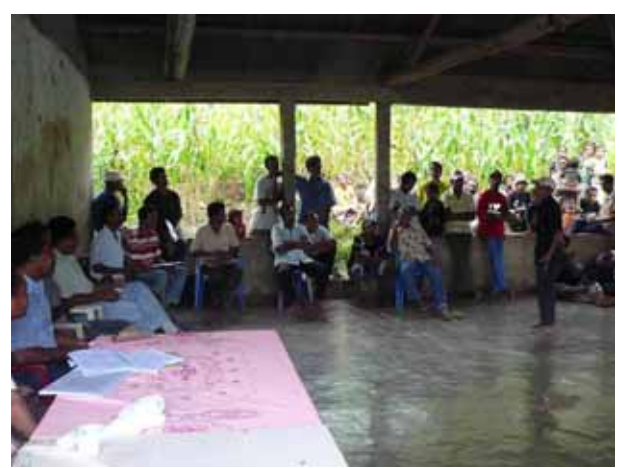
Socialization Meeting at Suco Tohumeta

Suco Tohumeta: January 31, 2008 Suco Samalete: February 1, 2008 Suco Faturasa: February 2 and 4, 2008 Suco Batara: February 15 and 16, 2008