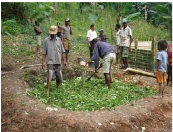
Training on Compost Making at Tohumeta

Halarae conducted a hands-on training course on compost making at each aldeia of Suco Tohumeta between March 3 and 7, 2008. The participants went through the first process of compost making, such as i) land preparation, ii) digging a hole / making a cage, iii) piling and leveling materials, iv) application of hands-made EMs, and v) covering piled materials. Succeeding training sessions will be further carried out from April to June, 2008.