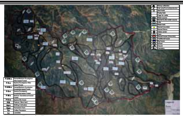
Draft Present Land Use Map of Faturasa