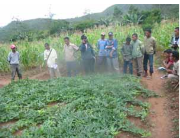
Exposure visit at Quinta Portogal