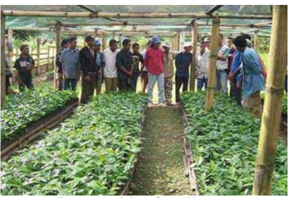
Exposure visit at Suco Mertutu