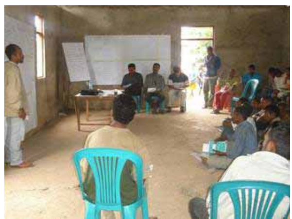
Participatory Planning Workshop at Faturasa

It was good opportunity for group members to understand the outlines of the sub-programs and also foster a sense of accountability of the sub-programs among members' minds. In the workshops, they discussed the major activities to be undertaken under the sub-programs, expected outputs, contributions to be made by the members, and inputs to be given by the NGOs.