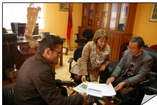
<Discussion with the Director >

Environmental Education plays important roles in the Conservation and Sustainable Use of the National Park. The Directory of Education in Lushnje welcomed our collaboration to work closely with schools. In cooperation with schools, Directorate of Forestry Service, National Park office, joint activities will be organised.