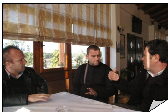
<Preparation for the workshop>

In order to brush up the draft Management Plan, we have worked with many wide ranges of stakeholders inviting all walks of life. National level workshop will be held with participation by the professionals in protected area management from all over Albania as well as the Ministries, Local Government and Local Stakeholders.