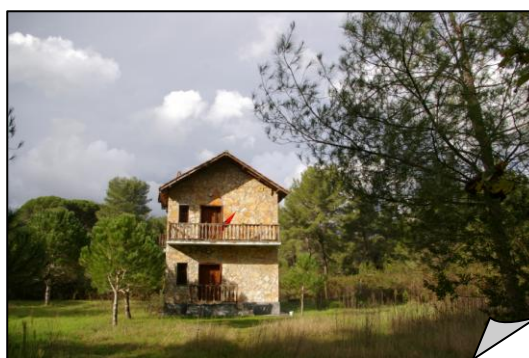
<National Park Office>