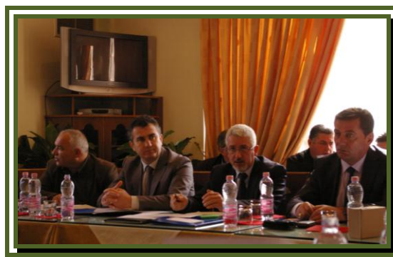
<Discussion at the MC>