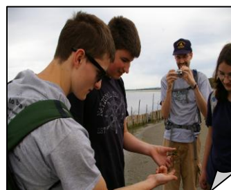
<Enjoying nature with rich biodiversity>