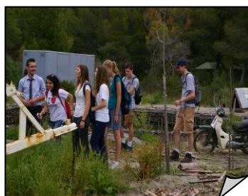
<At the small lagoon>

English: http://www.jica.go.jp/project/english/albania/001/news/general/130610.html