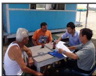
<Interview on the recreation area plan >