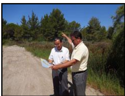
< Ground survey for the borders >

For the sustainable use of the recreation zone, conservation and facility complex plan of Divjake is in elaboration. Survey studies are made in cooperation with the National Park Office and Divjake Municipality. The process of elaborating this plan is expected to be a model case for other two recreation zones in the DKNP.