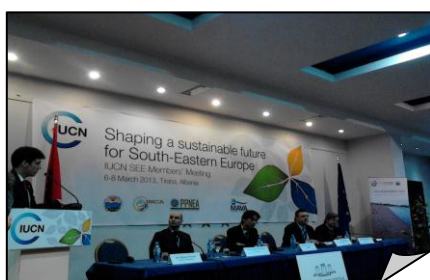
< Global experts gathered >

In March, 3 days workshop was held by International Union for Conservation of Nature and Natural Resources (IUCN), more than 40 experts attended from 16 countries. Common issues were shared and fruitful discussions were made. We maintain close contact with various organizations, both (inter)national and (non)governmental, to share common practice and for the betterment of the project.