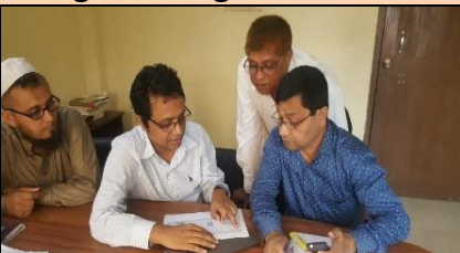
OJT (RpCC, September 2019)

Tax and budget management manuals have been drafted in reference to classroom and on-the-job trainings that had been conducted for CC finance staff in 2018 and early 2019. Key features of the manuals include: (i) introduction of budgeting, budget execution monitoring and reporting forms based on C4C-proposed accounting codes, which are linked to the government’s accounting codes system (BACS), (ii) guidance on financial projections and medium-term budgeting, (iii) laying out requirements and procedures on holding tax as per the existing rules and practices and (iv) guidance on internal control in revenue management.