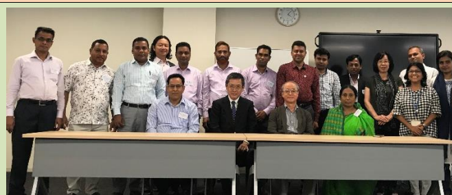
Lectures in Ritsumeikan University (Osaka, Japan, August 2019)