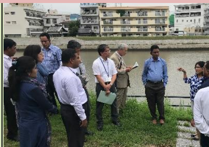
Visit to Danbara Area