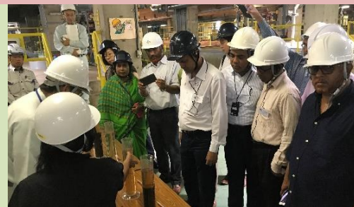
Visit to Aki Sanitation Centre (Hiroshima, Japan, September 2019)