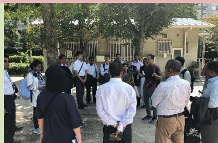
Visit to Kawaramachi Park