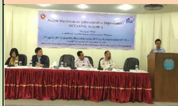
Review Workshop on 2018/19 administrative improvement (Dhaka, June 2019)