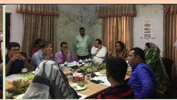
CC General Meeting discussing 2019/20 administrative improvement (NCC, September 2019)

C4C assists CC-level administrative improvement activities through PDCA cycle in five areas: legal instruments, work process improvement, tax & budget management, citizen engagement, training management. Activities and achievements for FY 2018/19 were reviewed in a workshop in Dhaka on 24 June 2019. Students who had received the 1 st prize in the school essay contest on “the role of students in keeping the city clean” were invited to the workshop and gave speeches, inspiring adult participants. In parallel, the CCs have started the next cycle, preparing action plans for FY 2019/20 based on model action plans suggested by LGD through C4C.