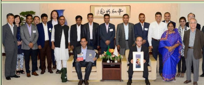
Courtesy call on Hiroshima City Mayor (Hiroshima, Japan, September 2019)