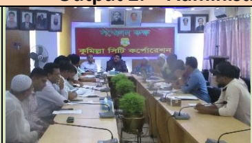
Administrative Reform Committee (ARC) meetings (CuCC, September 2019)