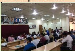
(GCC, September 2019)