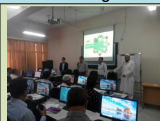
Tax Training (Dhaka, October 2019)