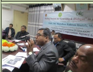
RpCC (January 2020)