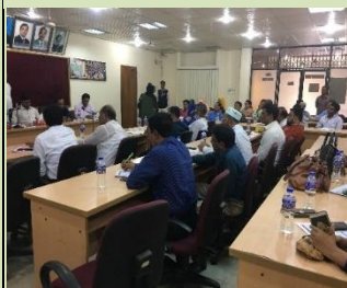
GCC (November 2019)