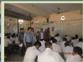
School Essay Contest (RpCC, November 2019)

As part of administrative improvement for FY 2019/20, the 4 CCs focus on work process improvement for promoting food safety. A training was conducted on 18 – 19 December 2019 with the aim of establishing systems of regular inspection of food and drink products, proactive citizen monitoring & reporting and handling of citizen complaints on food safety. 54 from the 4 CC including food inspectors, staff and Councillors took part in the training imparted in partnership with Food Safety Authority and FAO. The program was inaugurated by LGD Additional Secretary (Urban Development) as Chief Guest and closed with vote of thanks by the C4C Project Director. The participants set out actions for improving the existing condition of hotels, restaurants and food shops. In parallel, the 4 CCs initiated school essay contest on the theme of ‘Safe Food for All for the Protection of Life and Health’. 1,500 students of ninth and tenth grades from 17 schools in total so far have completed the contest. Each CC’s Work Improvement Team (WIT) guides the contest, visiting the schools and encouraging the young citizens. The school teachers and food and sanitation officers in each CC will review the essays to select top students, who will be recognized in the CC’s award ceremony.