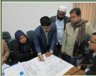
Food Safety Training (Dhaka, December 2019)