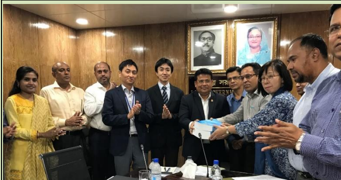
Presentation of the Compendium of CC Legal Instruments at the JCC Meeting (October 2019)