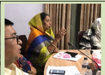
NCC (January 2020)