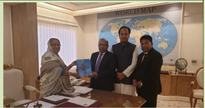
Presentation of the Compendium by the LGRD Minister to the Prime Minister (February 2020)