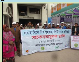
Tax Campaign (RpCC, January 2020)