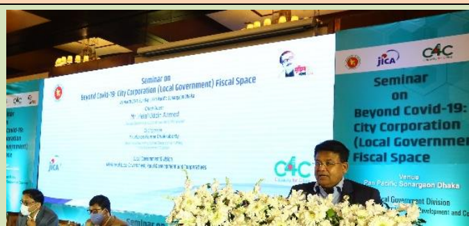
Speech by Senior Secretary, LGD