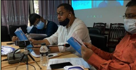
Legal Refresher Workshop in CuCC (November 2020)

Legal refresher workshops were held in GCC, RpCC, CuCC and NCC in Oct. – Dec. 2020. Councillors and senior officials took part in the event in each CC connected on zoom with Dhaka and Japan. Using the “Handbook on Statutory Framework for City Corporations” adopted by LGD, the councillors were guided on their responsibilities and authorities for framing legal instruments at CC level. The 4 CCs have deliberated on the Regulations on Standing Committee and Citizen Feedback & Grievance Redress, following model regulations prepared by LGD through C4C based on the procedure set out in the City Corporation Act 2009. 3 CCs have adopted the regulations, which are now with LGD for vetting and gazetting.