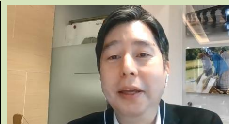
Speech by Chief Representative, JICA Bangladesh Office