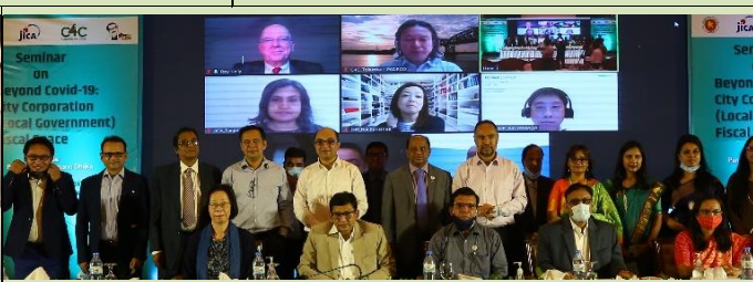
LGD & JICA C4C Team