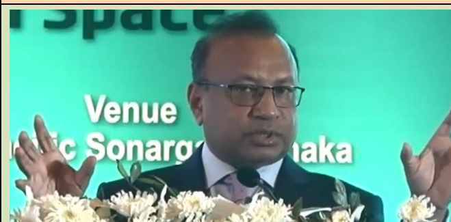
Speech by Hon. Minister, MoLGRD&C