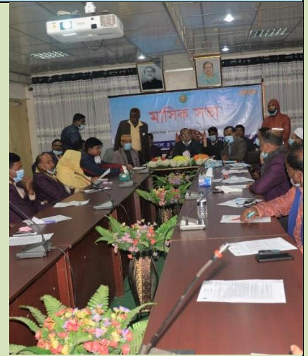
General Meeting for Regulations Approval in RpCC (December 2020)

Legal refresher workshops were held in GCC, RpCC, CuCC and NCC in Oct. – Dec. 2020. Councillors and senior officials took part in the event in each CC connected on zoom with Dhaka and Japan. Using the “Handbook on Statutory Framework for City Corporations” adopted by LGD, the councillors were guided on their responsibilities and authorities for framing legal instruments at CC level. The 4 CCs have deliberated on the Regulations on Standing Committee and Citizen Feedback & Grievance Redress, following model regulations prepared by LGD through C4C based on the procedure set out in the City Corporation Act 2009. 3 CCs have adopted the regulations, which are now with LGD for vetting and gazetting.