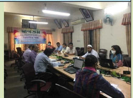
Work Improvement Team (WIT) Meeting in NCC (March 2021)

AI activities that had been halted due to the covid pandemic were rebooted with an online review & planning workshop held in each CC during Sept. – Dec. 2020. Despite setbacks in some of the activities, the 4 CCs had largely achieved the targets set in the action plans. The ward councillors who had been leading the AI activities immediately took initiatives for coping with the pandemic in their areas, which was shared as positive impacts of the AI. They have also contributed to disseminating covid prevention leaflets produced by the JICA “Clean Dhaka” technical cooperation project. An award ceremony for school essay contest on “Safe Food for All: Responsibilities of Students” took place in RpCC after postponement since March. Though it was held in a smaller scale in observance of covid prevention measures, ten top award-winning students were invited to the city hall and received prizes and certificates from the Honourable Mayor.