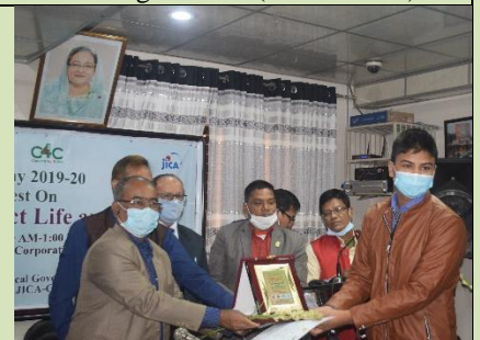
Award Ceremony for School Essay Contest in RpCC (Nov.2020)