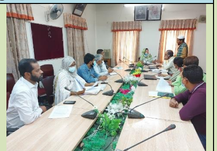
Standing Committee Meeting in NCC (February 2021)

The 4 CCs have completed annual financial statements for FY 2019/20. The forms updated by LGD through C4C have enabled the CCs to comply with the City Corporation Act 2009 that says the CC prepare an annual statement of accounts by 31 December after the closing of every financial year. The 4 CCs are also guided to prepare budget execution and ward-wise holding tax collection reports every month and quarter using related forms.