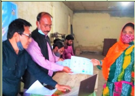
Clean Dhaka Leaflet Dissemination in RpCC (March 2021)