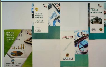
Financial Statements of the 4 CCs in compliance with the CC Act

The 4 CCs have completed annual financial statements for FY 2019/20. The forms updated by LGD through C4C have enabled the CCs to comply with the City Corporation Act 2009 that says the CC prepare an annual statement of accounts by 31 December after the closing of every financial year. The 4 CCs are also guided to prepare budget execution and ward-wise holding tax collection reports every month and quarter using related forms.