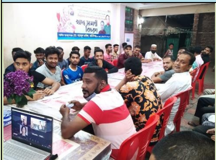
Ward Level Coordination Committee in CuCC (March 2021)

AI activities that had been halted due to the covid pandemic were rebooted with an online review & planning workshop held in each CC during Sept. – Dec. 2020. Despite setbacks in some of the activities, the 4 CCs had largely achieved the targets set in the action plans. The ward councillors who had been leading the AI activities immediately took initiatives for coping with the pandemic in their areas, which was shared as positive impacts of the AI. They have also contributed to disseminating covid prevention leaflets produced by the JICA “Clean Dhaka” technical cooperation project. An award ceremony for school essay contest on “Safe Food for All: Responsibilities of Students” took place in RpCC after postponement since March. Though it was held in a smaller scale in observance of covid prevention measures, ten top award-winning students were invited to the city hall and received prizes and certificates from the Honourable Mayor.