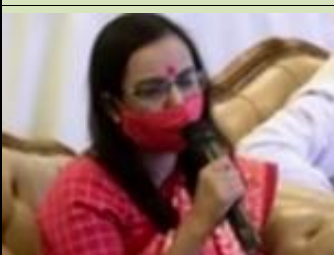
Discussions with Officials