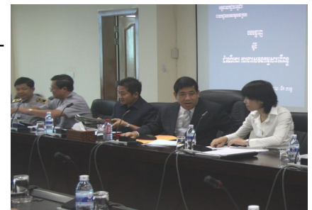
OJD with the presence of DG

The Project marked one year from the commencement, and JCC was held successfully