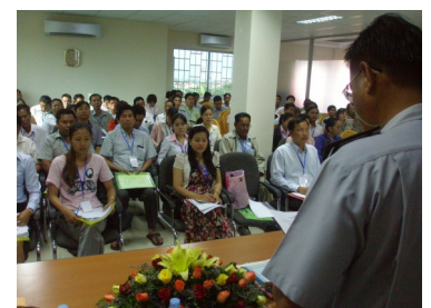
Taxpayer Seminar at Khan Russay Keo Tax Branch

27 Feb-1 Mar: Workshop for “Taxpayer Service, using Media” at GDT. Taskforce members will join.