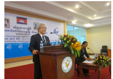
Public Lecture at National Tax School