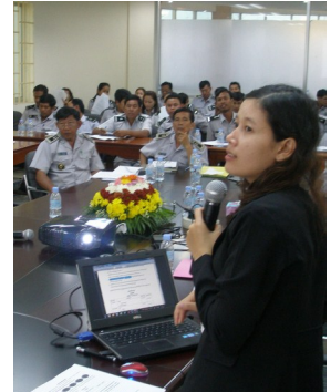
Basic Accounting for Trainers