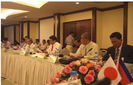
The first JCC at Phnom Penh Hotel on the 2nd Aug.