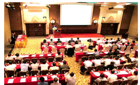
Workshop held at InterContinental

eral of General Department of Identification (MOI), senior officers from MOC, MEF, GDCE, MPWT and NBC attended a workshop conducted at InterContinental Hotel. Guests from other ministries applauded the progress of R/M and emphasized the importance of cooperation for Exchange of Information (EOI).