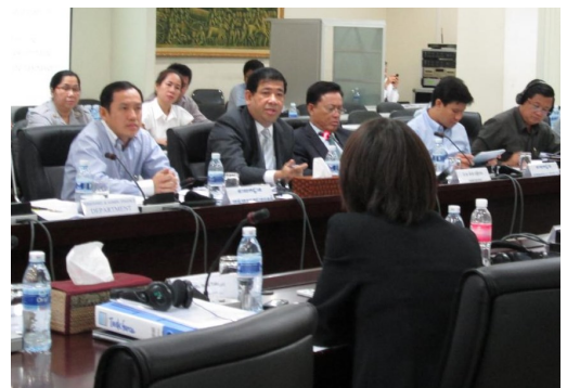
Discussion at JCC in Room# 611