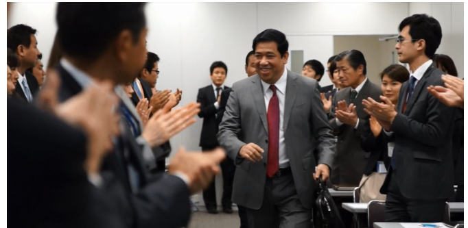
CPTA welcomes DG