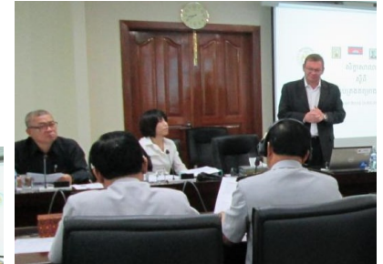
63 senior officers attended the workshop