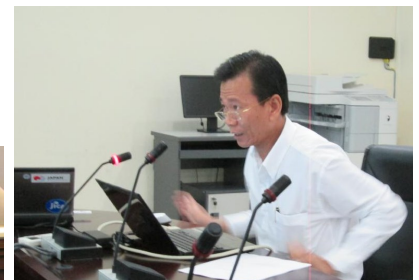
Discussions at GDT