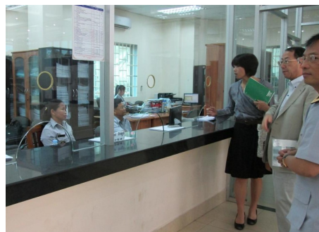
Well organized office, Khan Tuol Kork Tax Branch

shared thoughts on how to improve return processing. Proposed workflow was submitted to DG in August.