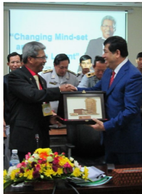
DG with Malaysian CEO