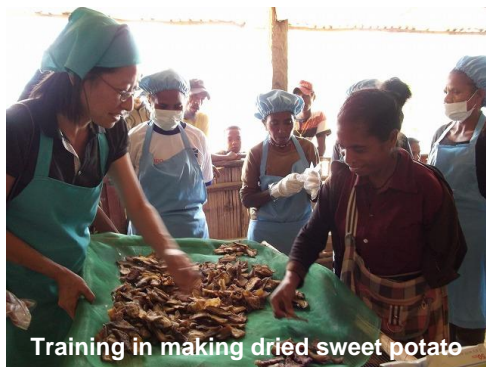
Training in making dried sweet potato

On June 12 and 19, the NGO with the assistance of PARCIC (a NGO working in Maubessi) conducted the first batch of training in making dried sweet potato for all the women's groups of IG/LD-MP in Suco Fadabloco. The members of the groups learned and practices the whole process of producing dried sweet potato from processing to packaging of the products. The remaining three batches of the same training will be conducted in July and August, so that the members of the groups can fully acquire techniques of producing dried sweet potato.