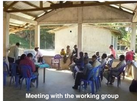
Meeting with the working group

explain the draft regulations with the future land use plan to other communities of the village in the consultation meetings at each aldeia in July 2012.