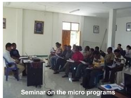
Seminar on the micro programs