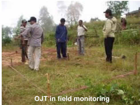
OJT in field monitoring