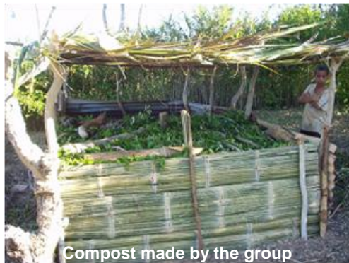
Compost made by the group