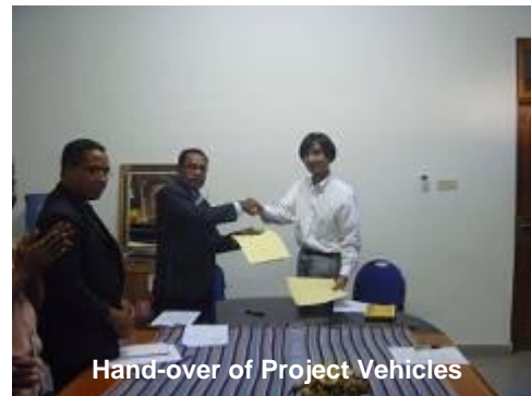
Hand-over of Project Vehicles

handed over to MAF/NDF on June 14, 2012 to improve the mobility of the JICA and MAF project Teams.