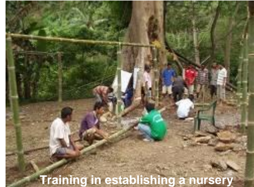
Training in establishing a nursery