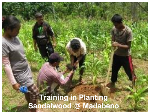
Training in Planting Sandalwood @ Madabeno

After the above-mentioned hands-on training sessions except that for maintenance of seedlings, the beneficiaries' groups distributed the seedlings produced in the nurseries to the respective members so that the members could plant seedlings in their plots in accordance with the techniques that they learned through a series of training. A total of 21,139 seedlings were planted by 244 households in the individual plots in both villages.