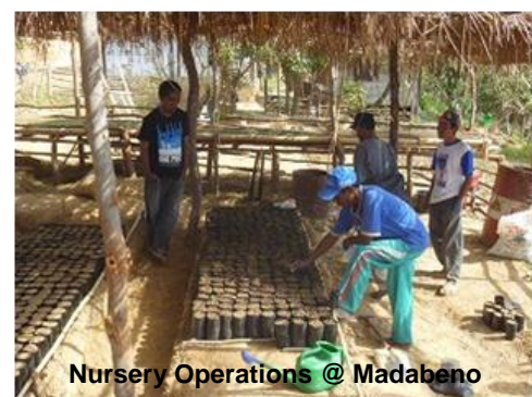
Nursery Operations @ Madabeno

In addition to training/OJT in production of seedlings, the following hands-on training/FFSs