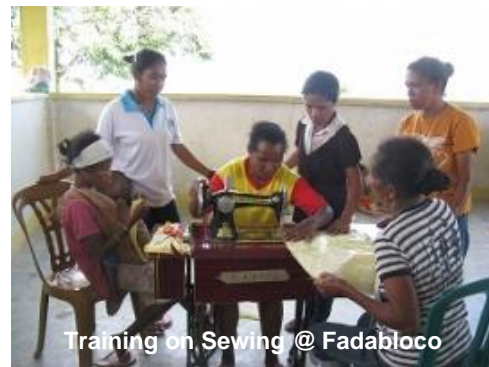
Training on Sewing @ Fadabloco

training on marketing, accounting, and promotion of products.