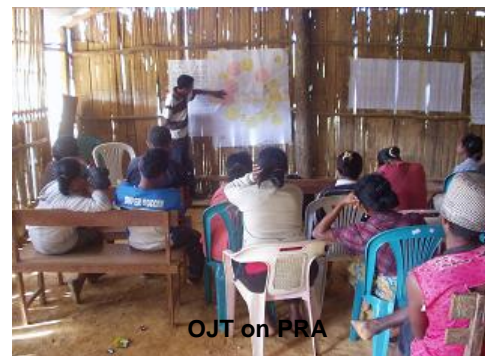
OJT on PRA

The JICA Project Team organized the OJT of the members of the MAF Project Team in conducting PRA sessions in Suco Fahisoi on January 23 and 24, 2013 so that they could practice the key PRA sessions in the field. A total of 15 members were involved in the preparatin of field sessions, operations of PRA, and report making in the course of the sessions.