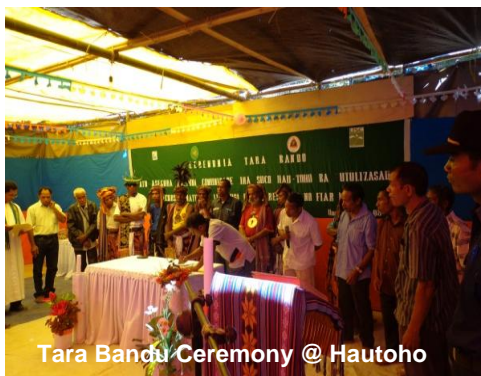
Tara Bandu Ceremony @ Hautoho

Local communities in Suco Hautoho held a traditional ceremony named Tara Bandu ceremony on August 14, 2013 inviting more than 400 participants including Secretary of State for Forest and Nature Conservation, Chief Representative of JICA Timor-Leste Office, and Sub-district Administrator of Remexio. In the ceremony, the village leaders announced the enforcement of the village regulations briefing the major articles. The same was held in Suco Tohumeta on September 4, 2013 with about 70 participants including Sub-district Administrator of Laulara, District Director of MAF in Aileu, and representative of NDF.