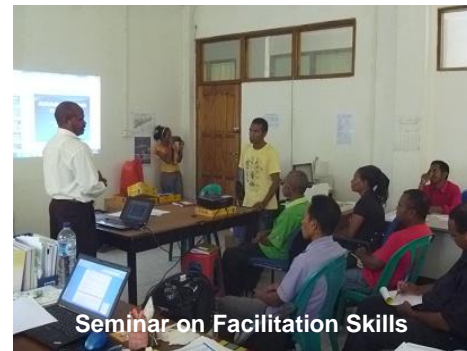
Seminar on Facilitation Skills