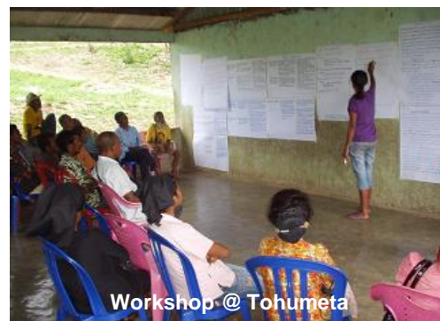
Workshop @ Tohumeta