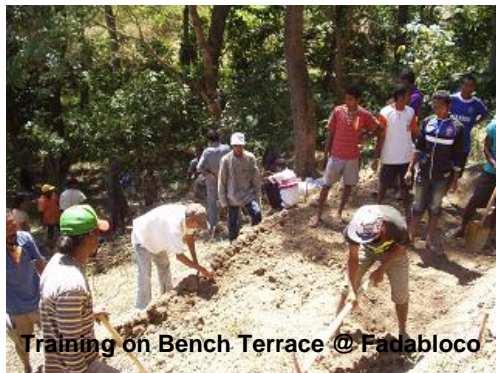
Training on Bench Terrace @ Fadabloco

Improved varieties of upland crops (i.e., maize, sweet potato, peanut, and cassava) supported by Seed of Life were planted in the demonstration plots so that the beneficiaries' groups could produce improved seeds to distribute to the members in the next cropping season.