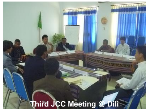
Third JCC Meeting © Dili

The JICA and MAF Project Teams assisted NDF in the organization of the 3 rd and 4 th JCC meetings in October 2012 and March 2013, respectively. In the former meeting, the members discussed the progress of the Project and approved the annual plan of operation (APO) of the Project for 2013, while the results of the mid-term review of the Project were the main topics discussed in the latter.