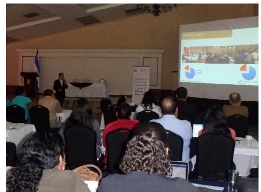
First National Workshop in San Salvador

In the workshop, the experience of establishment of the local committees of the El Jocotal and Olomega lagoons was shared. The project seeks to develop an institutional framework which ensures the integrated management, as a model approach applicable to the conservation and sustainable use of other wetlands in the country.