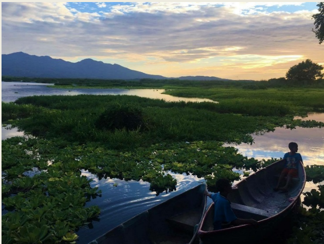
El Jocotal Lagoon

The daily activities in the wetland of El Jocotal Lagoon depend on a great extent on the natural resources. The lagoon is an important livelihood for fishermen and their families. The natural beauty of the lagoon attracts the local and international tourists.