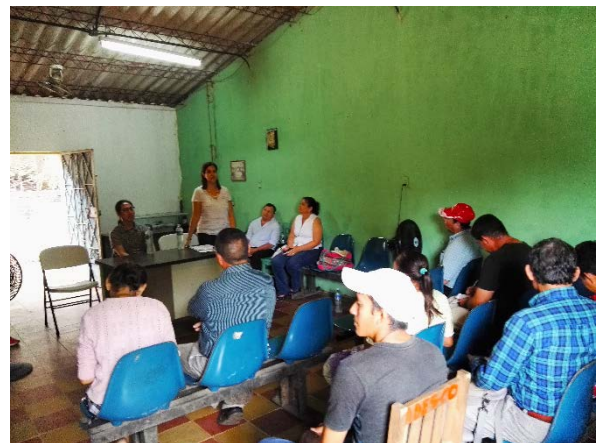
Meeting with the communities of El Jocotal and Olomega

seek for financial source for the planned activities for the wetland management, and promote environmental awareness raising campaign.