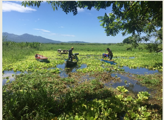
El Jocotal Lagoon

Due to the consequences of anthropogenic activities and the effects of climate change, the water hyacinth of the invasive species ( Eichhornia crassipes ) found in most of the lagoons of the country. The water hyacinth reproduces faster than the other species, and covers the large area of the lagoon surface at once. This increase of the water hyacinth has negative affect on some of the aquatic and terrestrial species, and fishing and tourism activities. In El Jocotal lagoon, based on the National Plan for the Improvement of Wetlands, MARN is promoting activities to contribute to solve this issue jointly with the Associations of Community Development and local governments, and NGOs.