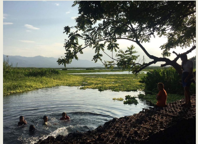
El Jocotal Lagoon, a place where children and adults can have fun

El Jocotal lagoon also provides place where both children and adults can have fun, run, swim and relax. Since the lagoon plays an important role for human to provide a place for rest and relax, it is important to raise awareness of the importance of conservation of this precious natural resource for the present and future generations.