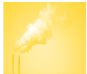
Kyushu is famous for metal production.

experts from Egypt attended the similar training course in this area. The programme will include lectures on KAIZEN techniques, observation on KAIZEN activities at a factory, interviews and discussions with owners, managers and employees of companies and the like.