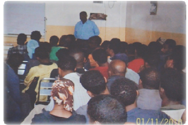
Training for QCC by Kaizen Core team