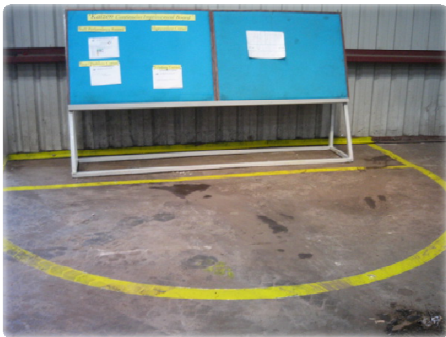
Kaizen Board & Visual Management system ensure that everyone has a common viewpoint towards companies goals and keep everyone well informed in a transparent way.