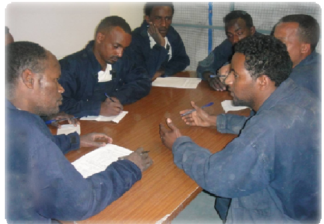
QCC meeting on how to improve their process