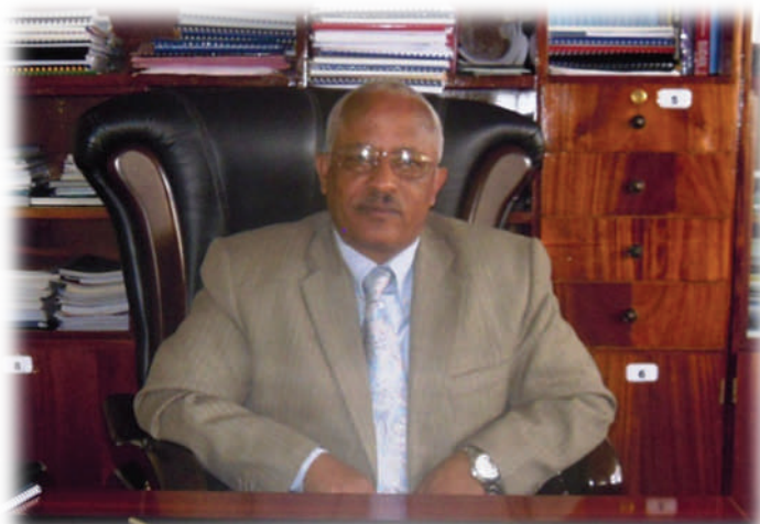
H.E. Alemayehu Tegenu Minister, Ministry of Water and Energy

“The water supply and the sanitation in Ethiopia are very important activities for our population’s benefit. Serving safe drinking water contributes to the health condition and accelerates the development of this country. It does not only help our farmers in rural regions but also reinforces economically, socially, and politically. We have a goal to achieve; increasing the water supply level to 98.5 % by 2015. We have only 2 more years left. The water supply coverage is still about 61.1 %, this figure shows us that we have a lot of things to do to improve our community. To contribute to the goal, the Ministry is ready to implement this project – the Project for Rural Water Supply, Sanitation and Livelihood Improvement through Dissemination of Rope Pumps for Drinking Water - with a support from JICA and the expert team.”