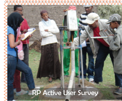
RP Active User Survey

If you have any comments, questions, suggestions, please contact us at;