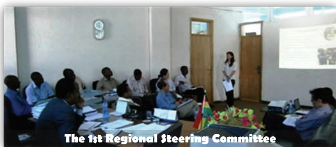
The 1 st Regional Steering Committee

At the end, the project plans were agreed by the participants from MoWE, WRB and all other related sectors and the project has officially commenced its activities.