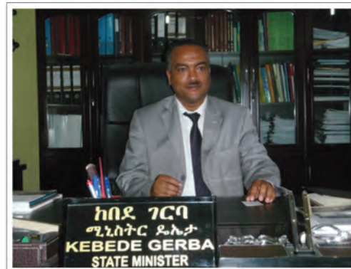
H.E. Ato Kebede Gerba State Minister, Ministry of Water and Energy

tribution to WaSH but also supports in our food security efforts too. The State Minister added, Improving and Standardization of Rope Pump technology are very important, but should not be the end target. Dissemination of the same should also follow quickly as we are left with only 2 years of the GTP time set.”