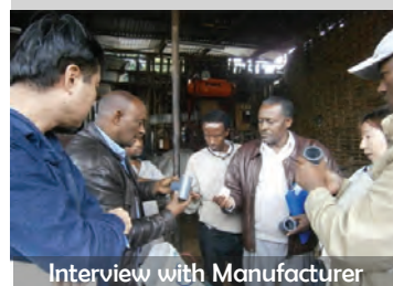
Interview with Manufacturer

If you have any comments, questions, suggestions, please contact us at;