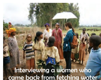
Interviewing a women who came back from fetching water