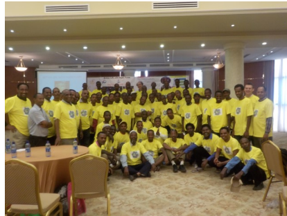
At the Business Skill Training how to have marketing activities for rope pump dissemination was discussed, the participants took group photo at the closing of the training (March 22).