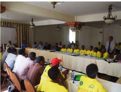
Omo Micro Finance Institute staff, Village Technicians and woreda government staffs discussed how to encourage rope pump user to repay their credit (March 21)