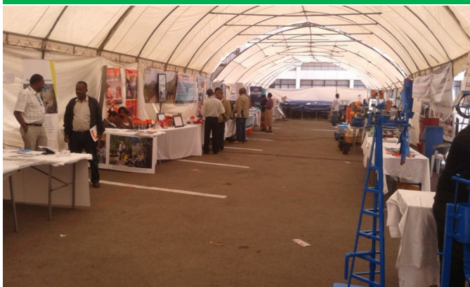
Exhibition stands by various actors