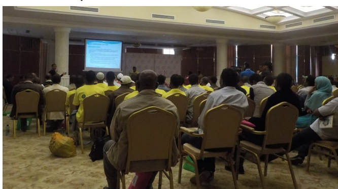
At conference hall in GET FAM Hotel, Addis Ababa, more than 130 people gathered for the seminar.

The second component of the Self-supply Fair was the one-day seminar (March 23, 2016) organized and undertaken at GETFAM hotel in Addis Ababa. More than 135 peoples (government, NGOs, donors, private sector and users) participated in the seminar. The seminar was opened by Mr. Tamene Hailu, Rural WASH and National WASH inventory coordinator of MoWIE, followed by the keynote address of Mr. Takeshi Matsuyama, JICA Ethiopia Office Senior Representative.