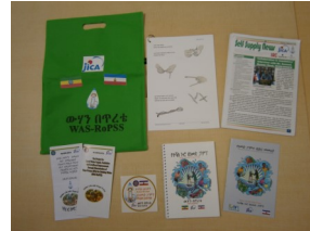
Various documents, booklets and novelty goods for rope pump dissemination and promotion are distributed to the participants.