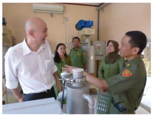
Cacao Plant will soon operate in Palu