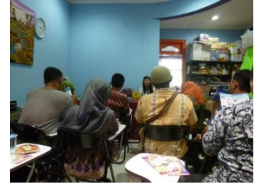
Discussion with a packaging company

Six SMIs from the aloe processing companies' association in Pontianak and five members from LWG participated in a comparative study tour of Jakarta and Bandung for packaging improvement from 3 to 5 November. The participants visited several packaging companies offering services tailored for SMIs, while having a meeting with the Indonesian Packaging Federation and the Mol Packaging Clinic to discuss various packaging issues. Each participant will utilize information and experience obtained from the study tour to establish beneficial linkage with the suitable packaging companies/organizations. Further, the association has set follow-up action to develop new packaging prototypes in collaboration with LWG and those packaging companies/organizations.