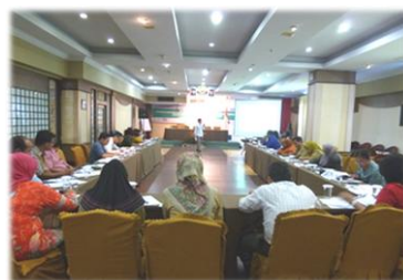
Seminar on ulos fashion industry

The SMIDeP approach has also created a success case in the cacao processing industry in Central Sulawesi Province, and the seminar for Region III has highlighted this case with sharing good practices, tips and lessons observed during the facilitation processes with the provincial governments which have the cacao processing industry or the potential for its development. The seminar, which two Directorate Generals of MoI (SMI and agro-based industry) jointly held, has shared a direction between the said two Director Generals to applying the development model and support menu facilitated in Central Sulawesi to other regions. In parallel with the seminar, an opening ceremony and study tour of a cacao processing factory in Palu was also arranged for the invited provincial governments to learn the development model and supports on the site.