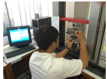
Strength test of shoes at BPIPI

One of the issues indicated by market tests and related support institutions during the course of the "Model Product Development Support Program" is poorly finished bonding between the shoe upper and sole. LWG in response requested the Indonesian Footwear Industry Development Center (BPIPI) to help testing concerning adhesive strength of prototype products. The test result revealed that the products from Mojokerto did not satisfy the national standard of adhesion, making target SMIs recognize their poorly finished bonding by figure. LWG, in further response to this test result, organized gluing training which introduced quality adhesives and adequate finishing practice of bonding to target SMIs. Last October, then, the target SMIs displayed improved prototypes at an exhibition held in Jakarta by preparing a special booth branded as "Cool Mojokerto". The Expert Team recognizes that LWG has been well facilitating the target industry in a flexible and timely manner according to the progress of the Action Plan and their needs.