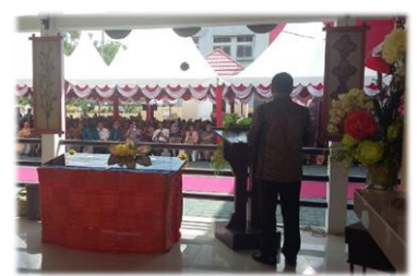
on cacao processing industry

The regional seminars have also introduced the important output of SMIDeP, technical guideline for facilitation of local industry development (being reviewed by DG-SMI) as a reference document to help the officers of local governments (Dinas Industry & Trade) in particular to realize the standard and improved facilitation processes and desirable facilitation outcomes. This technical guideline shall be further introduced to the regional governments on the occasion of a national seminar (to be scheduled in February 2016) in view of widely sharing the SMIDeP approach and experiences in facilitating local industry development.