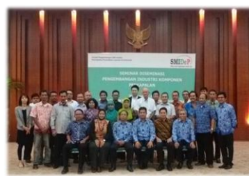
on ship-parts industry