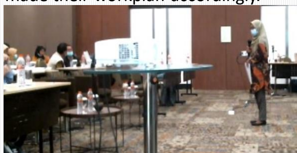
Lecture by Statistic Indonesia staff

Connected with Jakarta and Japan on-line