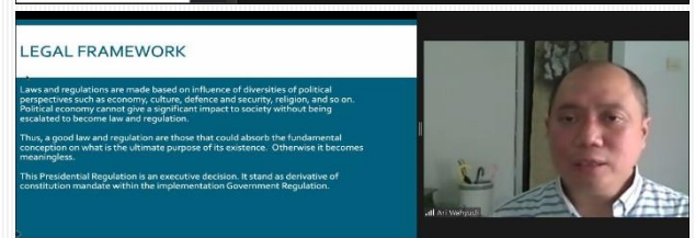
core team meeting