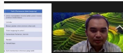
Lecture by MOA, and JASINDO

2 nd Training of trainers (TOT) on AUIP (Indemnity-based Paddy Insurance) for agricultural extension workers was held online on August 3-4 for South Sulawesi and 9-10 for East Java. About 72 people participated and actively discussed during the lectures by the Ministry of Agriculture and JASINDO (State-owned insurance company). On the second day, participants practiced the operation of SIAP and PROTAN, which are online system and application to register insurance subscription and claim.