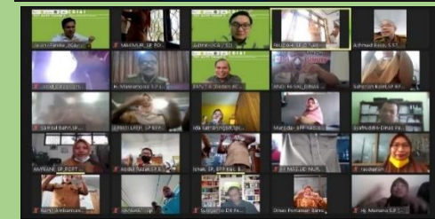
Active on-line training