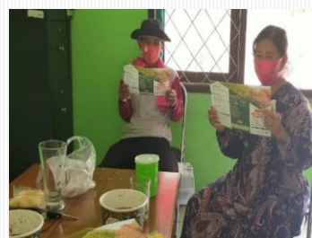
AYII Promoting Activities