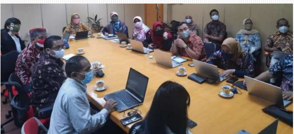
Discussion on guideline at MOA

Preparations and coordination are underway for the pilot projects of AYII (Area Yield Index Insurance) in 2 pilot areas. In Kendal District, Central Java, historical yield data was analyzed and premiums were set. In Karawang District, West Java, preparation for the 2 nd pilot activity is ongoing, following the results of the 1 st pilot activity conducted in last planting season. The preparation includes the revision of guidelines and compiling operation manual that could be used by those who work in the field.