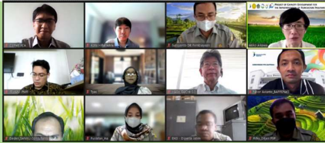
↑ Stakeholder coordination meeting

In 2021, the Project held two Training of Trainers of AOTP (Indemnity based agricultural insurance for paddy) for agricultural extension workers in East Java and South Sulawesi Provinces. The third training will be held in March 2022, and it will be an opportunity to hand over the AUPT Trainings from the Project to the Ministry of Agriculture and BAPPENAS (Ministry of National Development Planning). In order to ensure the sustainability of the training, BPPSDMP (Agricultural Human Resources Extension and Development Agency) will be invited to the training and it is expected that their trainers would become the master trainers for the agricultural insurance. Since the next training will be the last training to be organized by the Project, the Project is currently reviewing the lessons learnt from the previous trainings to be reflected to the last training.