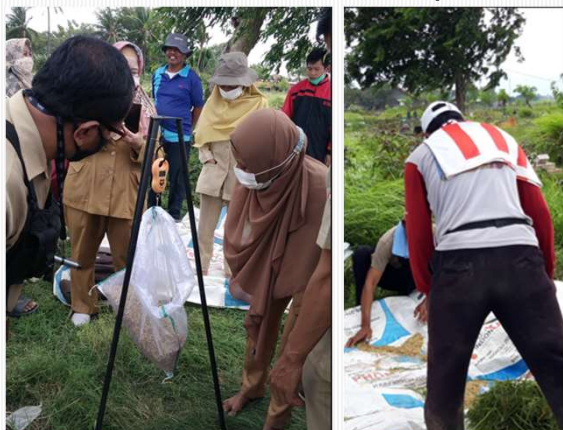
← Extension workers are doing CCE at Cibuaya Sub-District

On 25 January, the JICA expert team and the Ministry of Agriculture visited the Karawang District Agricultural Department to discuss on the AYII pilot and observed the CCE (Crop Cutting Experiment) of the harvest time at one of the pilot sites.