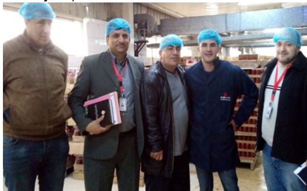
An Employee with intellectual disability works at Zalmoun company (with colleagues, employer and MOL officers)

"We have employed more than 150 PWDs. They are good workforce to us. We want to employ them more, then we started to train our staff as a Job Coach, currently we have 40 in-house Job Coaches and ready to receive new employees with disabilities." (HR manager, retailing company in Malaysia)