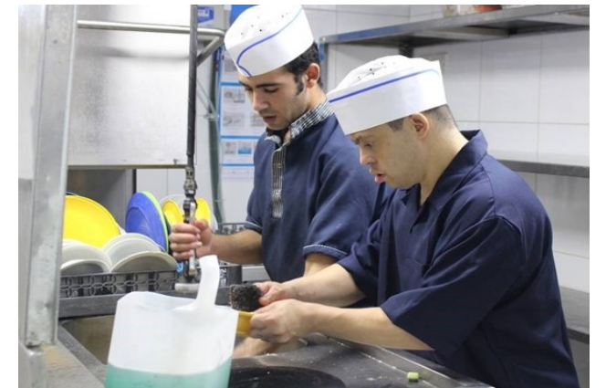
Person with intellectual disability at Qasar Hotel