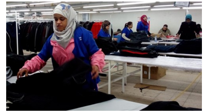
An employee with intellectual disability at Jerash Company

For recruitment of Job Seekers with disabilities, employers could contact to Employment Offices under MOL. The officers will consult.