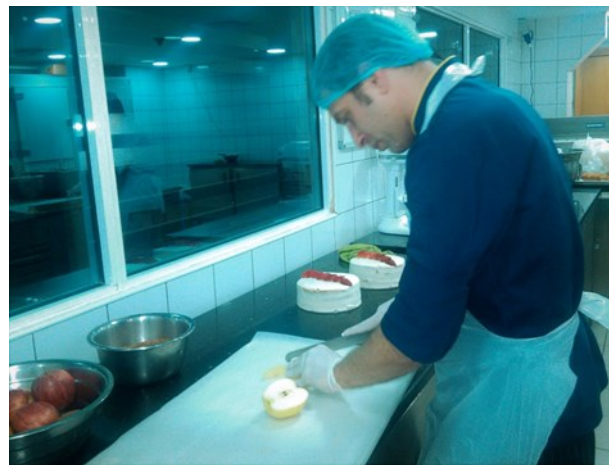
An Employee with hearing disability works at COZMO