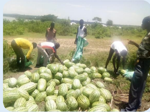
Group members inspecting produce before collective selling