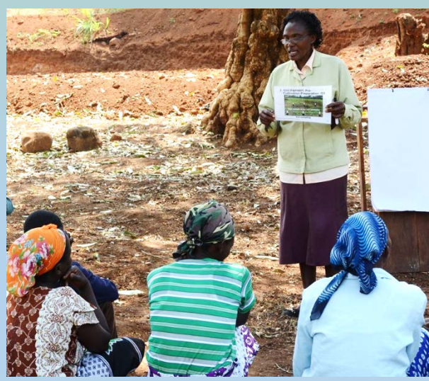
Utilizing Kamishibai to train farmers.