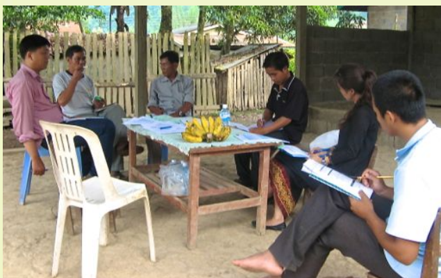
(2011 survey by PAREDD and consultant team)

PAREDD project plans to conduct field study for the impact of the PAREDD Approach in XGN after 2 year's implementation of several mitigation activities such as type1, type2 and type3 activity since 2012.