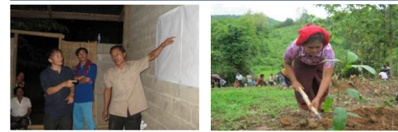
Planning in detail, for example "Plantation"