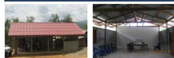
"Meeting room" constructed as Type3 activities