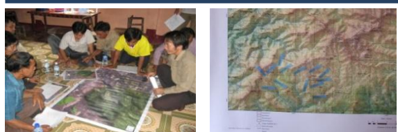
Forming the map of traditional boundaries