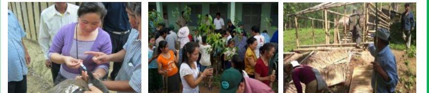
Vaccination Plantation Construction of Materials