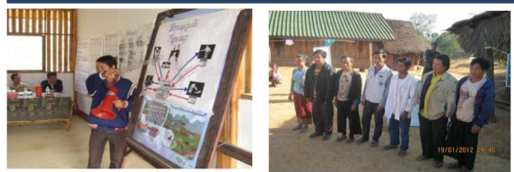
Telling to all villagers and electing the members