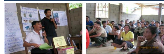
Deciding activities and inviting participants