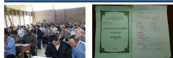
Making consensus and approve among all villagers