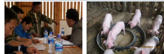
Planning in detail, for example "Pig raising"