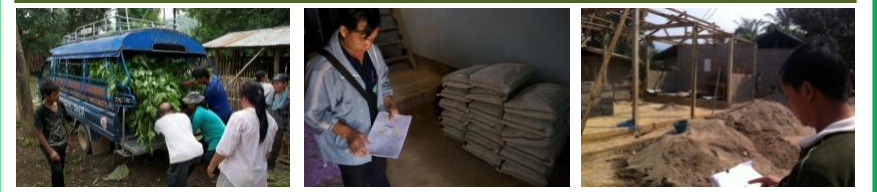
Seedling for plantation Checking quantity or quality of Materials