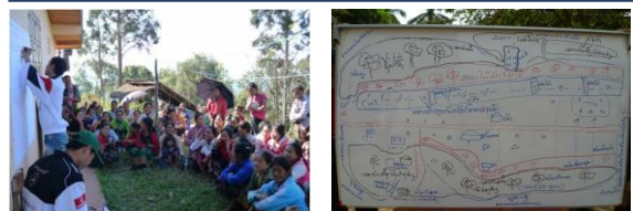
Discussing and Analysis at each village