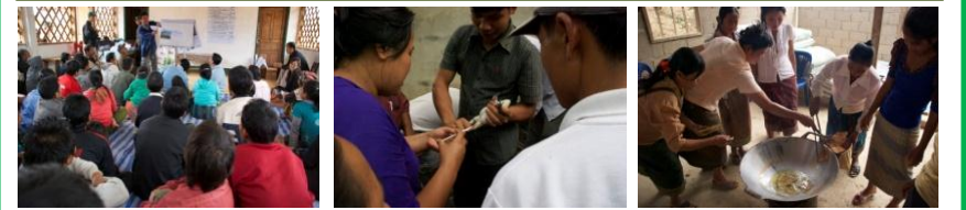
Lecture Village Veterinary System Food Processing