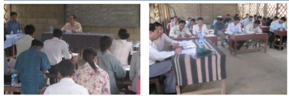
Telling the purposes, policies and process