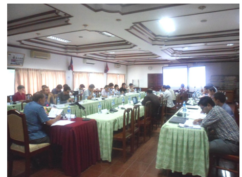
2nd REL/MRV TWG meeting

Furthermore, the Technical Working Group (TWG) — currently only five members officially appointed — suggested to introduce the 'assistant system', which would consist of adding more members to the TWG from the relevant departments, with the aim of strengthening the TWG foundation as well as providing more capacity building opportunities for the technical staff. The idea was highly welcomed and endorsed by the participants.