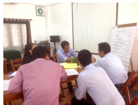
TWGs divided into groups for in-depth discussion

REDD+ in Lao PDR is now ready for full-scale implementation. Moreover, by having the six TWGs in operating, the coordination role of the National REDD+ focal points will become even more important.