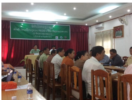
1st PRTF meeting participated by multi-sector representatives

In addition to the support to the central government, F-REDD is also supporting the REDD+ readiness of Luang Prabang Province.