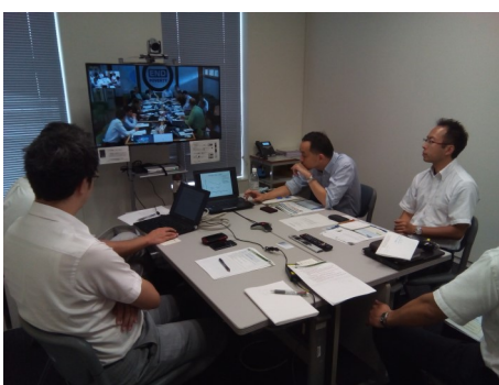
TV conference connecting Vientiane and Tokyo