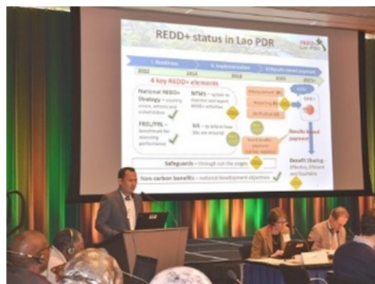
Presentation by the Lao PDR delegates at the FCPF meeting in Washington D.C.

*4 National Forest Monitoring System (NFMS): is the system for monitoring and reporting REDD+ activities. It is used as the basis to estimate forest related greenhouse-gas emissions and removals.