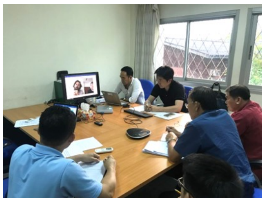
TV conference with the Assessment Team

Lao PDR submitted the National FREL Report to the UNFCCC in January 2018 under extensive support of F-REDD. The Assessment Team (AT), which consist of two experts of 'Land Use, Land-Use Change and Forestry (LULUCF)' selected by UNFCCC, is currently assessing the report. After the initial correspondences through emails from February to March, a TV conference was held during the 'assessment weeks', two weeks, in late-March between the AT and Lao side (Lao drafting team supported by F-REDD). After the intensive discussions during the 'assessment weeks', the exchange of opinions is still ongoing through emails. Lao PDR will submit the modified FREL report by the end of May 2018 reflecting these discussion results. Then, the AT will reassess the modified FREL Report and will have further discussions with Lao PDR. Finally, the final assessment report will be released in November 2018.