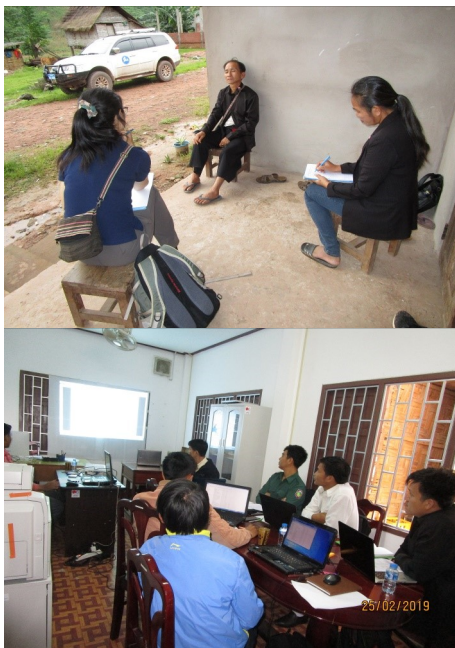
Socio-economic survey (above) The officer of Luang Prabang Province provided technical training (below)

JICA has been supporting participatory forest management in Luang Prabang Province for many years and decided to extend its support to Oudomxay Province, starting in April 2019. As a result of discussions with provincial officers, five villages were selected as project sites. All of them sit in the basin of Beng River — the major river in the province — and are upstream from the project sites of the Asian Development Bank's Rural Infrastructure Development Project. The Beng River not only serves the basic needs of the local population, such as by providing drinking water, but it is also used for agriculture and hydroelectric power generation. In this upstream area, deforestation and degradation are spreading due to slash-and-burn agriculture and the expansion of farmland. There is an urgent need to strengthen forest management in the catchment area.