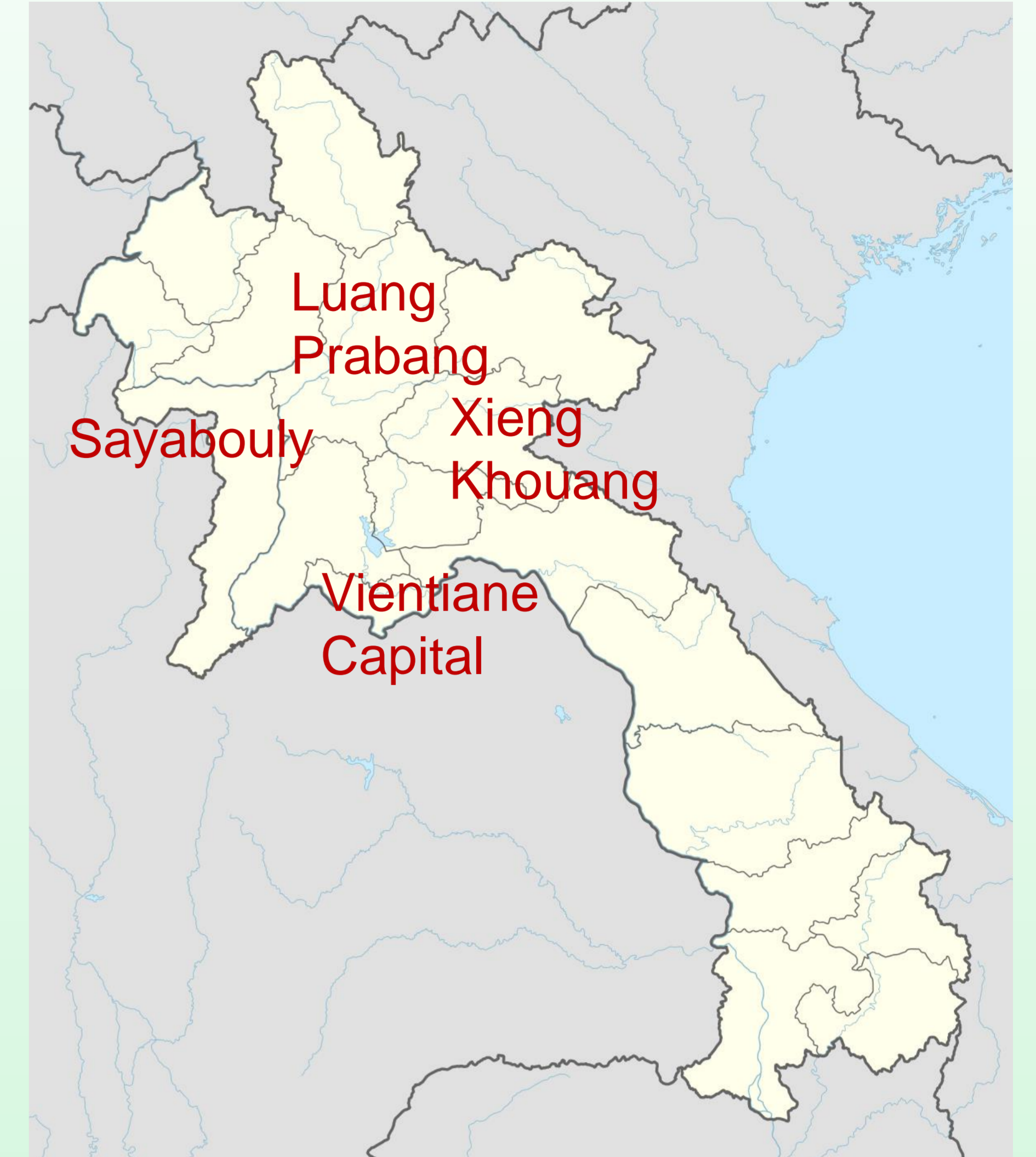
Four Pilot Provinces

➔ The necessary to promote CA in Laos by enabling farmers/farmers groups to respond to the market needs for CA products and expand their sales opportunities.