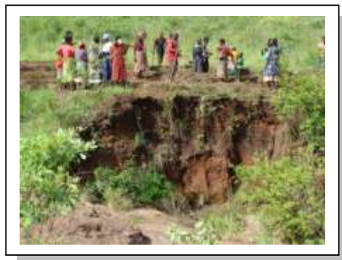
2. Large Gully in the Project Area