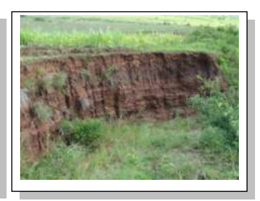
3. Maize Garden (Upper) and Large Gully