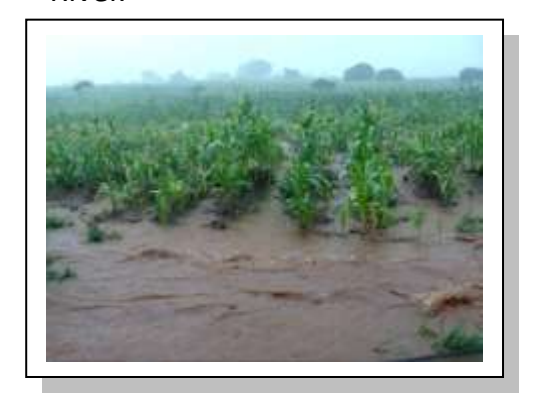
1. Condition of Garden during Heavy Rain fall