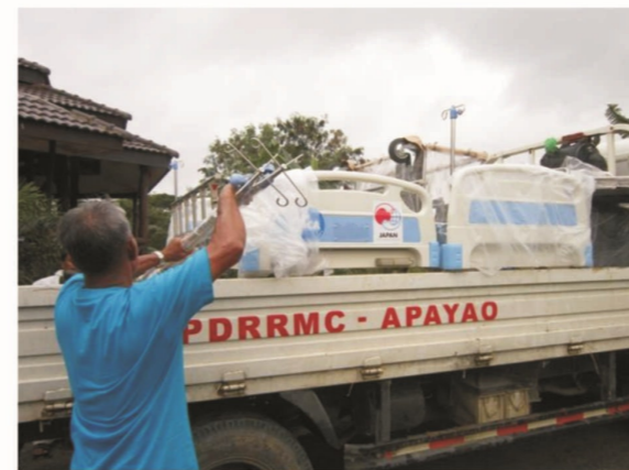
Equipment recipient's hospital personnel on loading their recovery tables and IV stand for Calanasan area (Apayao).

Witnessing the affair are 223 participants clad in ethnic attire from the 7 municipalities of Apayao represented by the provincial officials and employees, municipal officials, barangay captains of the birthing facilities, head of partner agencies, Chief of Hospitals, Chief Nurses, Municipal health Officers, Public Health Nurses, Midwives and CHTs. Also, among the witnesses are the members of the Inagkawan choir who sang the invocation, our Philippine National Anthem and the Japanese Anthem-Kimigayo beautifully. Dressed in the Isnag attire, the Inagkawan performing troupe also welcomed the guests and participants through the beating of the gong and Isnag dance.