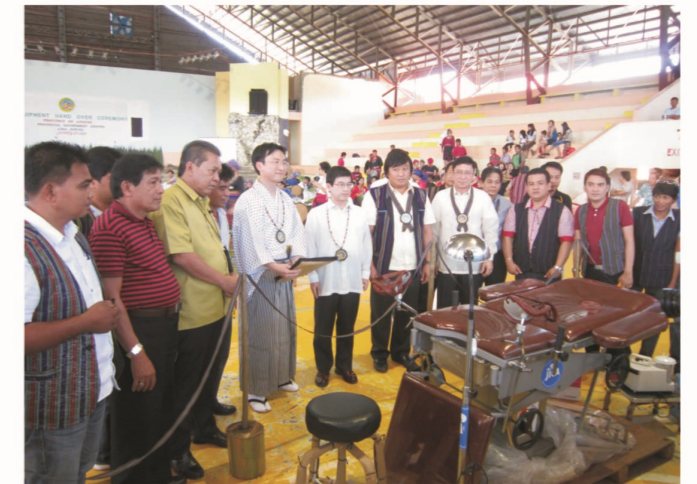
Hand-over ceremony in the province of Apayao.

The province of Apayao is a recipient of the JICA assisted project entitled Cordillera-Wide Strengthening of the Local Health System for Effective and Efficient Delivery of Maternal and Child Health Services which is geared towards saving the life of mothers and babies.