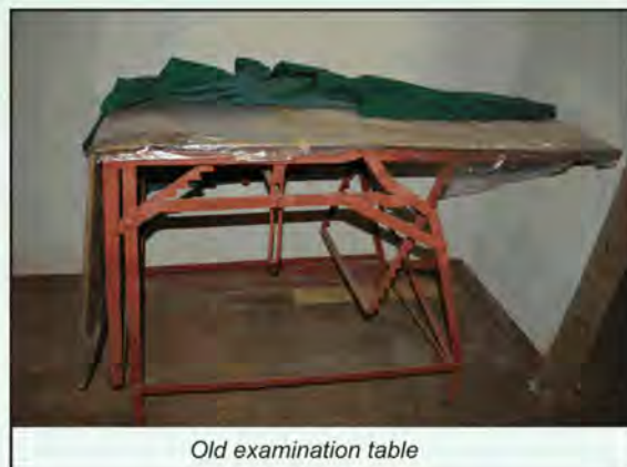
Old examination table

The Convention also saw the ceremonial turnover of equipment for the Barangay Health Station of Cayapa, Lagangilang. The birthing equipment include brand new delivery table and chair, recovery bed, medicine cabinet, bassinet, gooseneck lamp, BP apparatus with stand, suction machine, and even a burner stove and a generator. All equipment and the training of the staff are funded by JICA, who will be supporting MNCHN in Cordillera up to 2017.