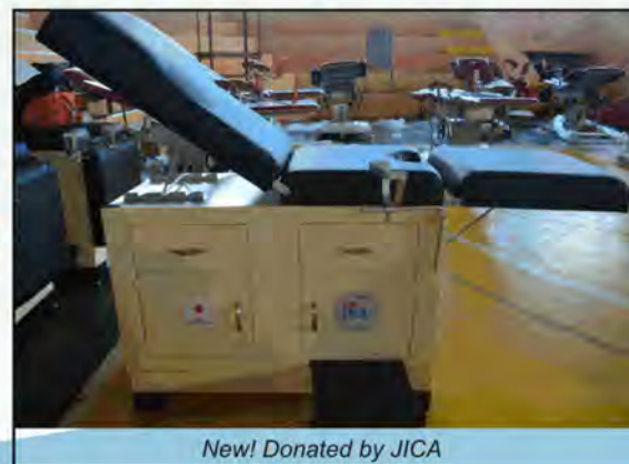
New! Donated by JICA