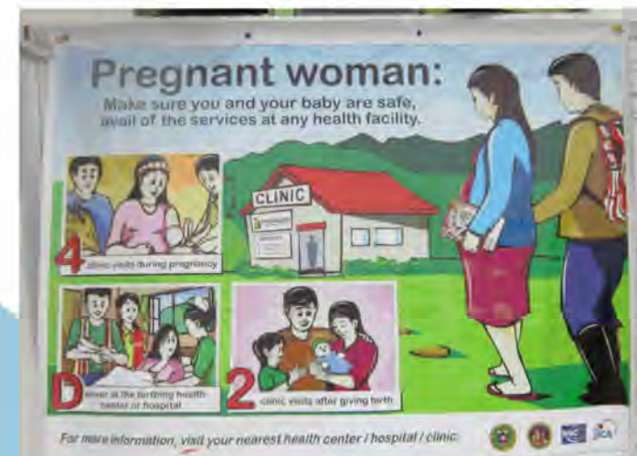
Project's developed Banner posted in identified populated area in the barangay

JICA - SSC Office, 3rd floor Regional Training Center, CHD-CAR, BGHMC Compound, Baguio City Telefax: (074) 422-0239