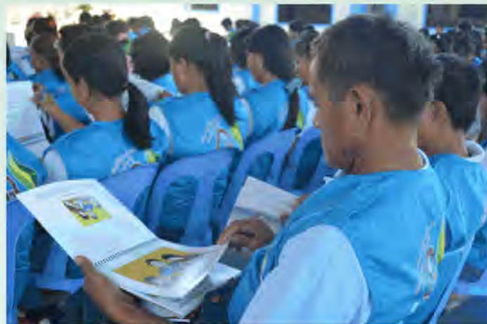
CHT members familiarizing with the flipchart