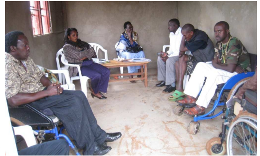
(Right photo) Kigali PRO in the meeting with ex-combatants (Ifoto y'iburyo) PRO wo muri Kigali mu nama hamwe n'abasezerewe mu ngabo