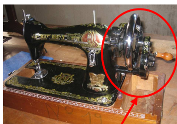
Handle/ Igikoresho cy'intoki