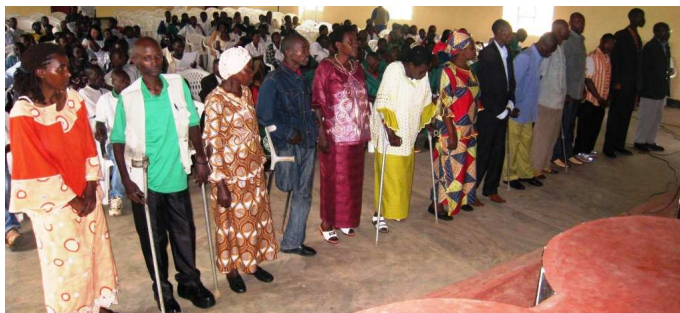
Graduation ceremony Female trainees were very beautiful with colorful traditional wear.

Abanyeshuri b'abagore b'Umushinga ECOPD ni 205 (20%) mu banyeshuri 1023 (muri Nyakanga 2012). Bahura n'ibibazo byinshi kuko ari abagore bakaba bafite n'ubumuga. Ubu, bahura na bagenzi babo bahuje ibibazo kandi bakigana mu kigo cyigisha imyuga, kandi buri muni bagenda barushaho gukomera no kunguka ubumennyi. Muri iki kinyamakuru ECOPD, turababwira abagore bateye imbere bahuguwe n'Umushinga ECOPD.