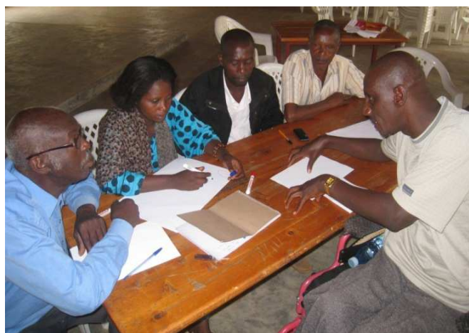
VTC staff and DET trainers in the DET Abakozi ba VTC n’abahugurwa kuri DET bari mu gikorwa cya DET