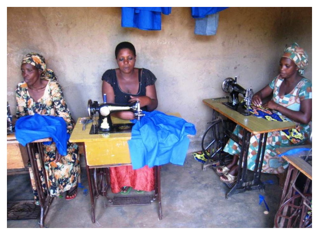
The cooperative members are proud of their works. Abanyamuryango ba koperative bishimira ibyo bakora.