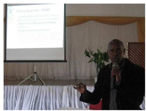
Presentation by MIFTORA lkiganiro cyatanzwe na MIFOTRA

Umushinga JICA/RDRC ECOPD wateguye Kwizihiza itangwa ry'igihembo ku wahaye akazi abafite ubumuga ufatanyije na NCPD (Inana y'Igihugu y'Abantu bafite ubumuga) na MIFOTRA