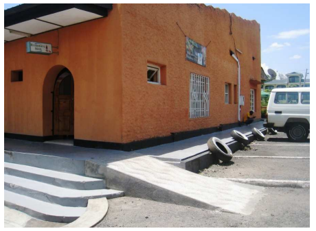
Ramps made by the Hotel Muhabura Utuyira duhanamye dusimbura ingazi twakozwe na Hoteli Muhabura