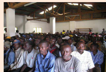
Participants of the screening Abantu baje mu ijonjora

Nyuma y'ijonjora, abanyeshuri 265 batangiye amahugurwa muri VTC Kibali, VTC Nyanza, VTC Rwabuye n'ikigo cy'Ubumwe Nyarwanda bw'Abatabona (RUB).