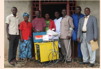
Cooperative member, welding trainer of VTC Gisenyi & Executive Secretary of Sector

Abanyeshuri bahawe amahugurwa guhera muri Nzeri bayarangije muri Werurwe . Abakozi b'umushinga babashyikirije ibikoresho by'intangiriro aho koperative zabo zikorera. Igihe twabasuraga, twabisobanuriye abayobozi b'inzeho z'ibanze n'abandi baturage.