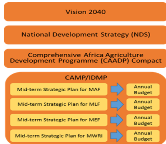
Policy framework in agricultural sector in South Sudan

CAMP/IDMP is also the investment plan under the framework of the Comprehensive Africa Agriculture Development Programme (CAADP) to achieve continental and regional agricultural development objectives.