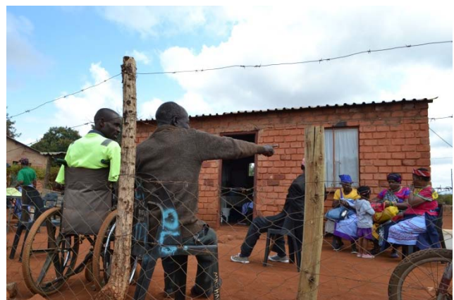
A Person with disability participating in community meeting