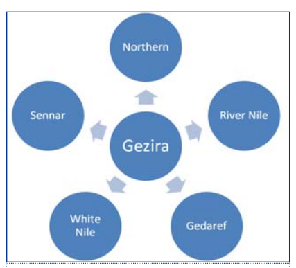
The image of the spreading upland rice cultivation, from Gezira State as the center of expanding upland rice in Sudan, to others.

JICA Rice cultivation experts with collaboration with the National Rice Project, Federal MoAI, MoA in Gezira, White Nile, Sennar, Gedaref, River Nile and Northern States are conducting demonstrations involving local farmers. This activity aims to introduce and expand upland rice cultivation by farmers in relevant states. It started from Gezira state and spread to other 5 states. For the 4th year (2013), the Project expanded 22 sites, more than 65 feddans in 6 states total. Not only extensionists gain cultivation experiences through management of demonstration farms but also local farmers can learn actual cultivation of upland rice. Target yield is 4 ton/ha in Gezira state and 3 ton/ha in other 5 states.