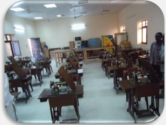
Women's training room

JICA already started their support to the KVTC according to the agreement between the Sudanese and Japanese governments on the Capacity Development Project for the Provision of Services for Basic Human Needs since Oct 2010.