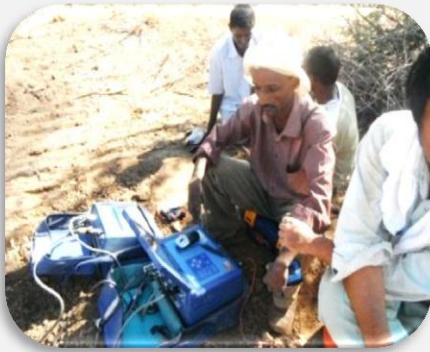
Geophysical Exploration in Northern Kassala

K-TOP intervention in water cluster includes an exploration and development of groundwater resource in northern Kassala. The exploration of groundwater had been done by adopting Geophysical