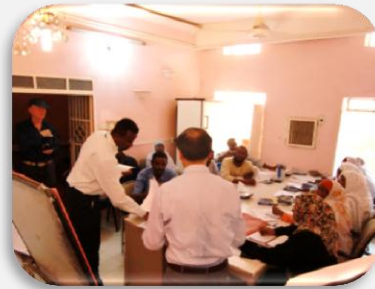
Training of Basic Financial Management in State Water Corporation

The main objective is to provide the target areas with adequate water supply.