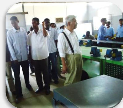
Study visits in Khartoum

the city (professionally and literally). Important information is collected from teachers and students of primary and secondary schools, KVTC trainees, employees, employers, and jobseekers. The Survey is still ongoing. The collected data will be used for improving KVTC curriculum.