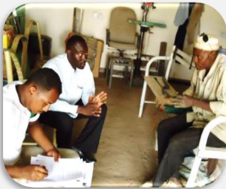
Labour Market Survey

The project prepared two kinds of TOT training inside and outside Sudan that is in Japan and Malaysia for the KVTC instructors.