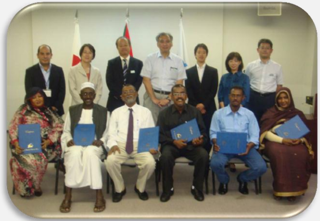
The participants received their Kaizen training certificates from JICA Osaka Office

Everything has been organized very well. We started our activities from next day by visiting Ministry of Agriculture where we met international cooperation director who explained to us Agriculture Policy of Japan in securing grains specially rice by production & import. In Hokkaido we