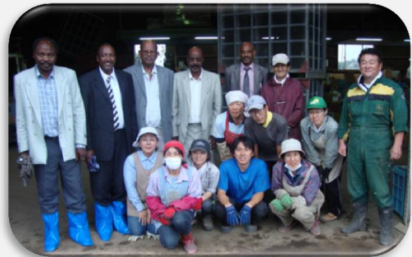
Kassala State Agriculture Team and the Japanese Experts

Kaizen is the bottom up philosophy; we can adapt it in planning in Kassala.