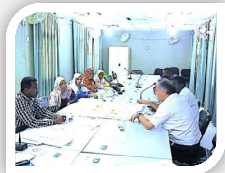
CUDBAS Workshop in General Directorate of Economic Planning and Development

So the workshop was successful and as K-TOP team leader said that after the result of this workshop we will go to start our necessary training in practice and we will put all our efforts together with project team to solve our work problems in this department.