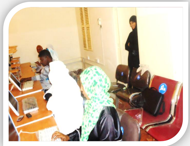
IT equipment and all materials for Civil Service database

On behalf of those who work for the States Civil Service, here I put forth our thanks and gratitude to the authorities of JICA and K-TOP for what they provided.