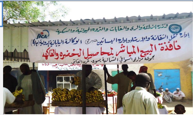
Opening day of the direct sale in the Garbel Gash market