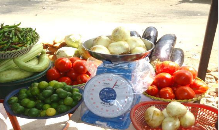
In the direct sell, the farmer groups are selling Agor, Tomato, Onion, Lemon, Chili, El korom.

For more information: Project Office General Directorate for Economic Planning and Development, Kassala State, P.O.Box 119, Sudan Tel +249-411-824-570 Fax +249-411-827-414