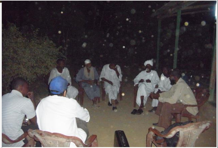
Meeting with farmers, TTEA extension officers and JICA team normally start the meeting after sunset when farmers finished their job.