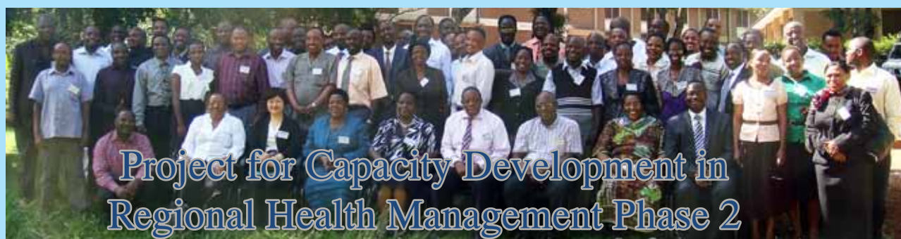
Project for Capacity Development in Regional Health Management Phase 2

Participants at the Project Inauguration Meeting in Morogoro 25th –27th January, 2012