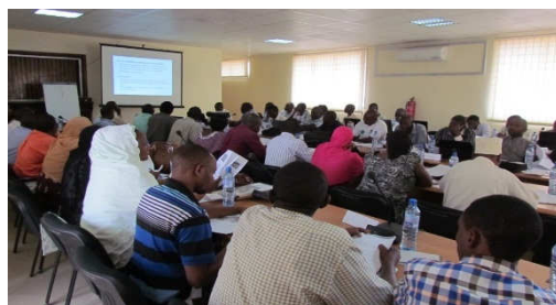
Dissemination I : Discussion of necessary steps of the guideline at Mtwara

ZITSUs are promoting 'Seminar of Formulation & Implementation Guidelines for all districts (Dissemination I)' and 'Practical training for the target 19 schemes