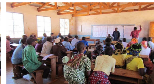
Dissemination II : Meeting of 'Financing Agreement' at Isaka irrigation scheme