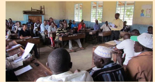
PC opens meeting with IO, district and contractor to share information and report of Fund expenditure under the support of the village government.