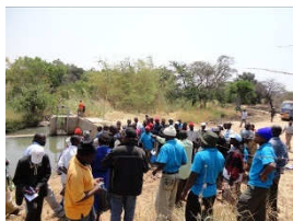
Narunyu & Mshewe farmers visited the Igomelo irrigation scheme to learn the irrigation management.