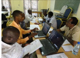
DITSU staff & DIDT members are discussion and making a Swahili handout for the dissemination training.