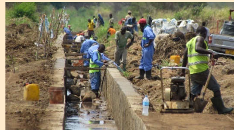
PC members are communicating contractor, district staff and beneficiaries closely to ensure smooth implementation of project.

Main canal 2,750m by Contractor & Tertiary canal 13,250m by Farmers' contribution