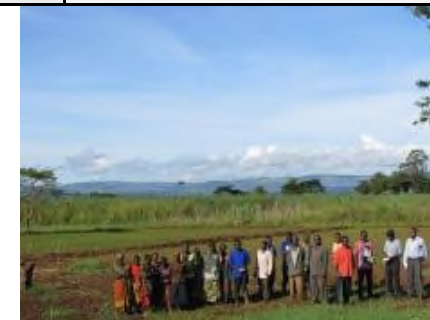
Tabora Dissemination II (Practical training): Kasulu.D, ZITSU promote secondary canal construction and rice farming together at Msambara scheme. Farmers start planting.