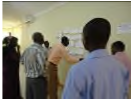
Participants are categorizing causes of the core problem concerning Weak Leadership of IO during Training Needs Assessment.