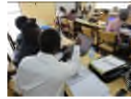
Participants are modifying the training materials in Swahili based on Training manual V4.