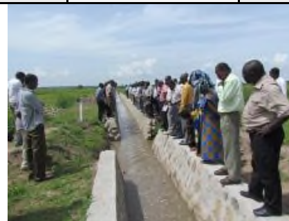
Mwanza Dissemination I (Site visit): Kwimba.D and PC Mahiga keep high quality of Construction. Farmers start using Dam water through Farmers' constructed ca-