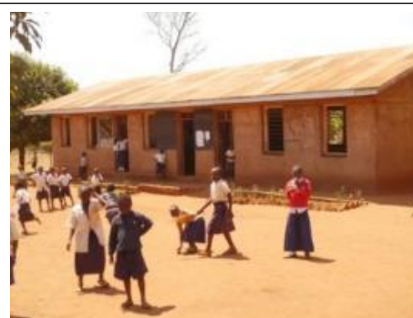
The first two classrooms built in 2006

The anxiety of parents was strong enough to push them not to just wait for the government project but instead to take actions on their own. Fortunately, there was a strong leadership of the Kitongoji Chairperson to bring together the community people to take actions in collective ways. In 2006, they started to make bricks. They collected money, sand and stones from each household. They formed a construction committee and set specific targets as a starting point to construct two classrooms and one teacher house by themselves. The process of construction work was also implemented by the community based on divided roles and time schedule utilizing bricks, money, sand and stones they collected. The community’s financial and material contribution together with their labor force amounted to Tsh 16,000,000 in total.