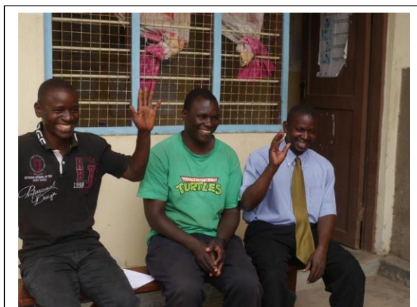
Village Engineers. They are locomotive for development in Matema.

When the village expressed this concern, they were given an opportunity to participate in the road rehabilitation training by Appropriate Technology Training Institute (ATTI) in 2013. 3 youths were selected by the community