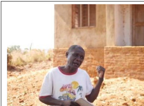
Vilage chairperson explained about continuous CIs

Meantime, the village chairperson emphasizes that in Libenanga Village, the people have strong ownership in the community development plans . Before, the projects at the village level used to be instructed by the government or decided