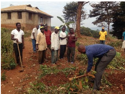
Villagers clearing the space around the office to make a path.