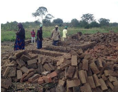
People of Mtoni hamlet working on their obligations at the site of Brick Bank

by the community of Libenanga through good management of the construction committee. In addition to this, there are some other secrets of the success besides strong commitment of the community.