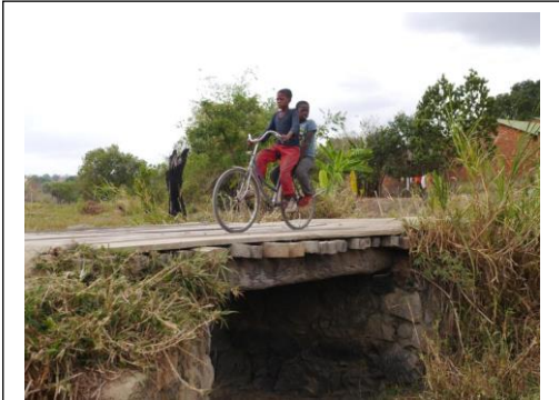
Wooden part was renewed by the community in 2016.

become very strong, in terms of willingness, ownership and organizational capacity to implement community initiatives. For instance, construction of