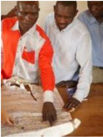
Village leaders reviewing their Community Development Plan 2016/17.