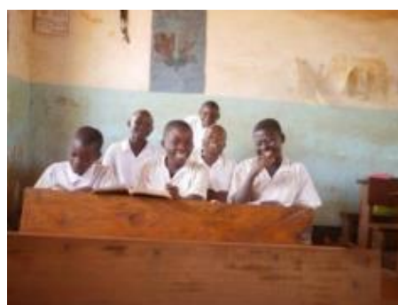
Pupils are so happy to study with new desks