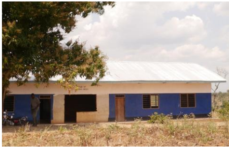
Primary School with two classrooms.

primary school classrooms, a bridge and community playground were initiated and managed at the kitongoji level. Through strong kitongoji, Matema Village is now capable to tackling various felt-problems that exist in the village.