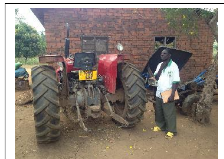
Village chairman and the tractor

Another secret of Libenanga is strong “Tractor Management”. Ulanga District Council provided tractors to 6 villages in 2014 so those villages could rent the tractor to farmers and Libenanga was one of the 6 villages. After receiving their tractor, Libenanga village elected members of “Tractor