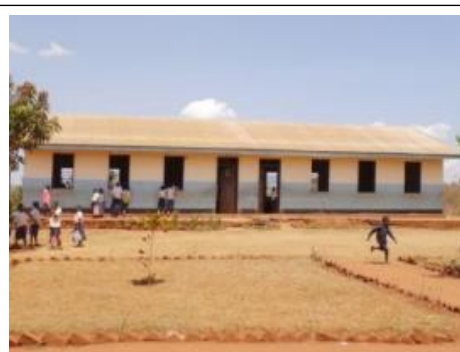
Classrooms built through cooperation with CDTF

time, community constructed another two classrooms and 2 pit latrines for the teachers. Again, District Council identified the community initiative and contributed cement and iron sheets amounting to Tsh 3.5 million. Since the additional classrooms were constructed by the community, the District's supports were utilized to construct 4 pit latrines for the students.