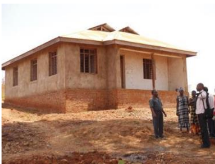
Village office almost completed as of October 2016.

bricks, and collected other necessary materials such as sand, stones, etc. as well as the financial contributions from the community.