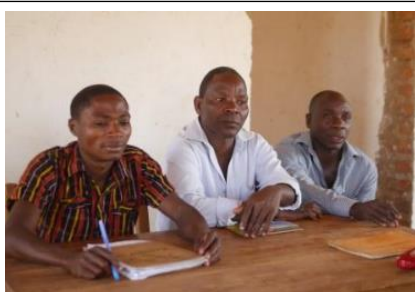
Original members of tractor management committee