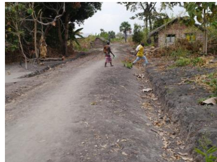
Road with strong shoulders. Result of community initiatives and competent village engineers