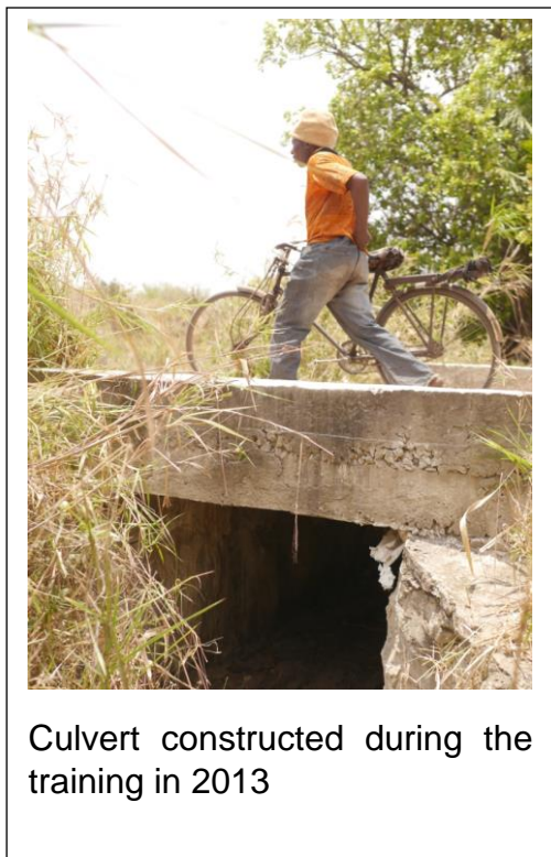
Culvert constructed during the training in 2013

Another point to be noted here is that not all villages who sent their representatives to the same training succeeded in utilizing the gained know-how in their village like Matema Village did. What was Matema's reason of success?