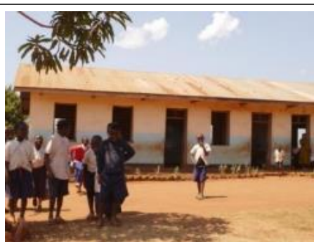
The second two classrooms built in 2009

In the year 2006, through a collaboration between the community initiative and District Council, Libenanga Primary School was launched with 2 class rooms, a teacher's house and 2 pit latrines.