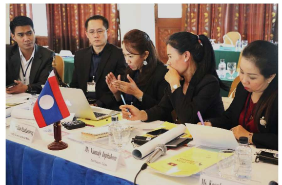
Cambodia Lao PDR